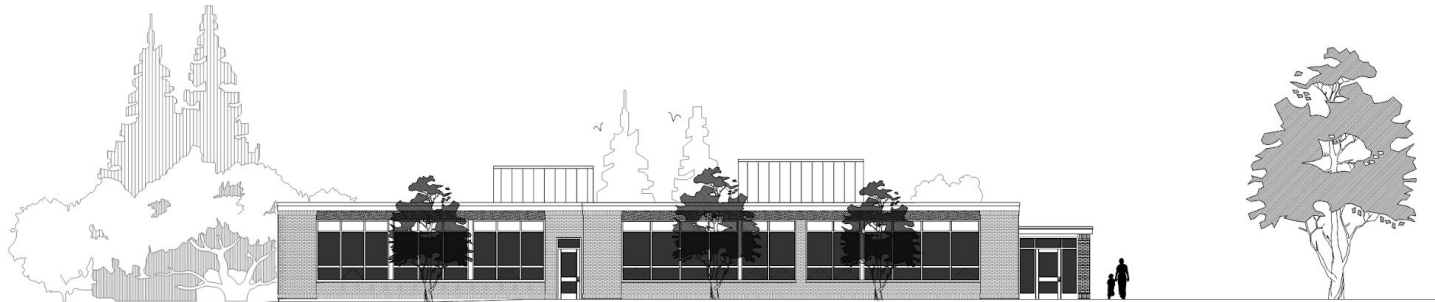
SOUTH ELEVATION 1/8" = 1'-0"

EARLY EDUCATION CENTER AT SMITH ELEMENTARY