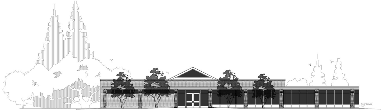
EAST ELEVATION 1/8" = 1'-0"

COLIN P. LINDBERG, A.I.A. 208 FLYNN AVENUE, SUITE 2B BURLINGTON, VT 05401 802-864-4950